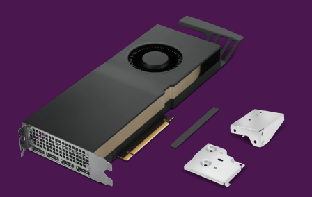
NVIDIA RTX™ A4500 Graphics Card

For a full list of accessories and options, please visit: accsmartfind.lenovo.com