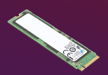
2TB Performance PCIe Gen4 NVMe OPAL2 M.2 2280 SSD